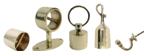
End caps, railholders, Brass