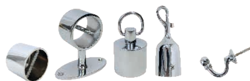
End caps, railholders, Chrome