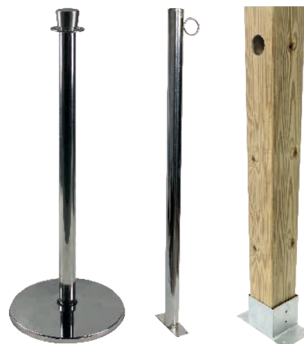
Rope post with ground plate